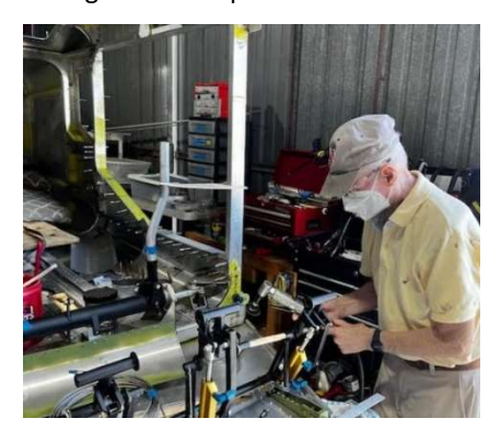
Cessna 150 - Steve Wing Root attach issues