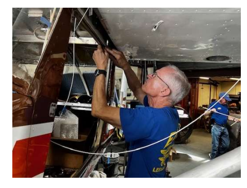
Stinson Future up for discussion